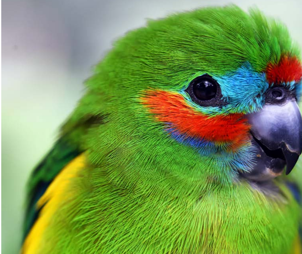
Double-eyed Fig Parrot, Kuranda, Queensland

Evagrius Ponticus wrote, "If your seriously desire true prayer and yet succumb to anger and resentment, you are out of your mind. If you want to see clearly, you do not scratch your eyes."