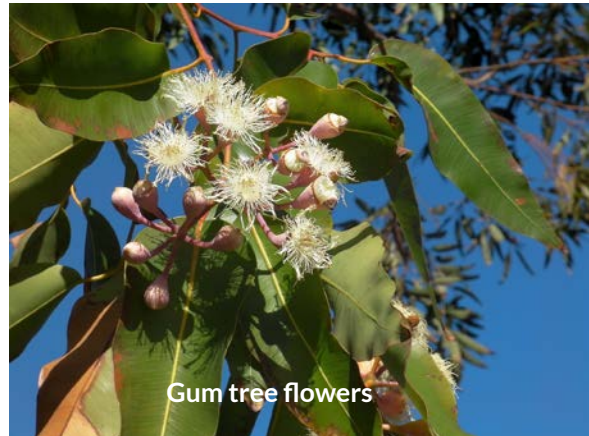
Gum tree flowers

This leads to us looking at our prejudices in a new light. Helps us to reflect on our lists, especially in trying to follow the greatest commandment by Jesus to love God and each other, and not let our prejudices get in the road.